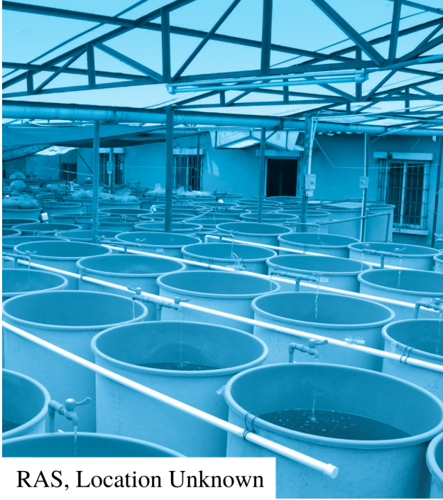
RAS, Location Unknown