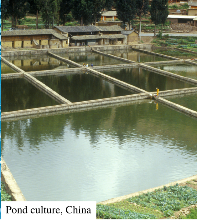
Pond culture, China

It is also important to keep in mind that the intensity of each system will affect its overall environmental impact. Intensity in the context of aquaculture refers to the amount of input (mainly feed, antibiotics, other agrichemicals, and oxygen) that is required to sustain the operation, as well as the stocking density of the culture.