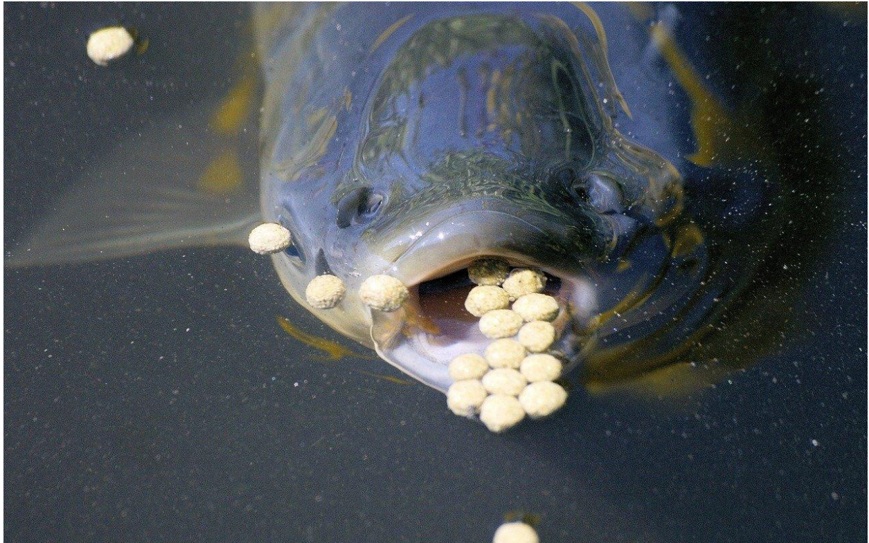
A farmed fish feeding on pelleted feed.

the welfare of the captive animals so that they feed more efficiently, leaving less uneaten feed in the culture and surrounding water as well as requiring less feed to begin with.