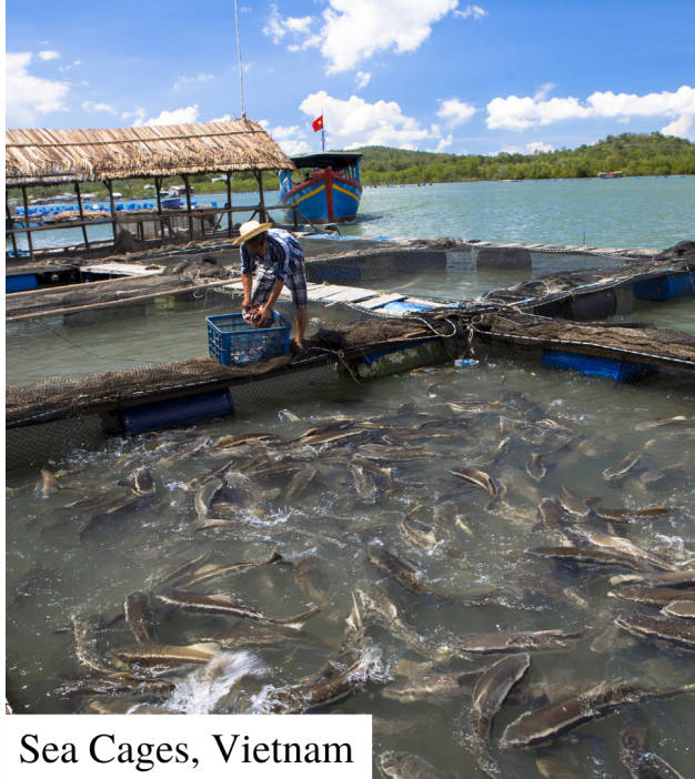
Sea Cages, Vietnam